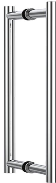
Double Door Handle shown with a small Rosette